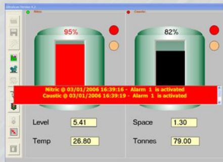
VISUAL ALARM INDICATION