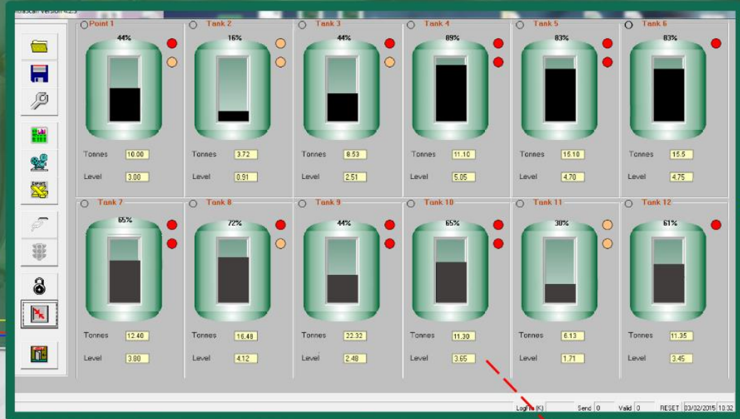
EXAMPLE OF ULTRASCAN SCREEN WITH 12 POINTS OF MEASUREMENT

High technology software for ultrasonic level measurement and control. Use with Blackbox and Ultra Modbus Controllers.